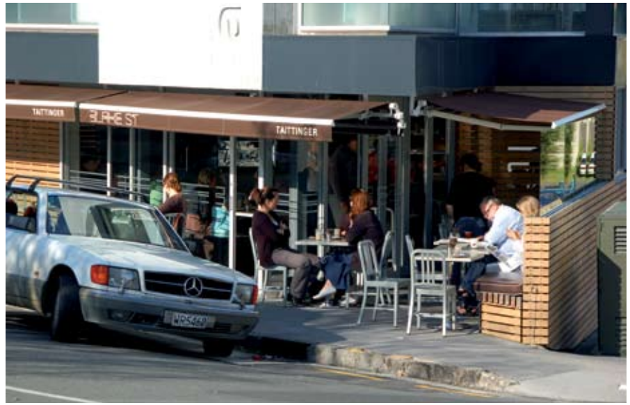
Mixed uses like parks and outdoor cafés bring life to a neighbourhood.